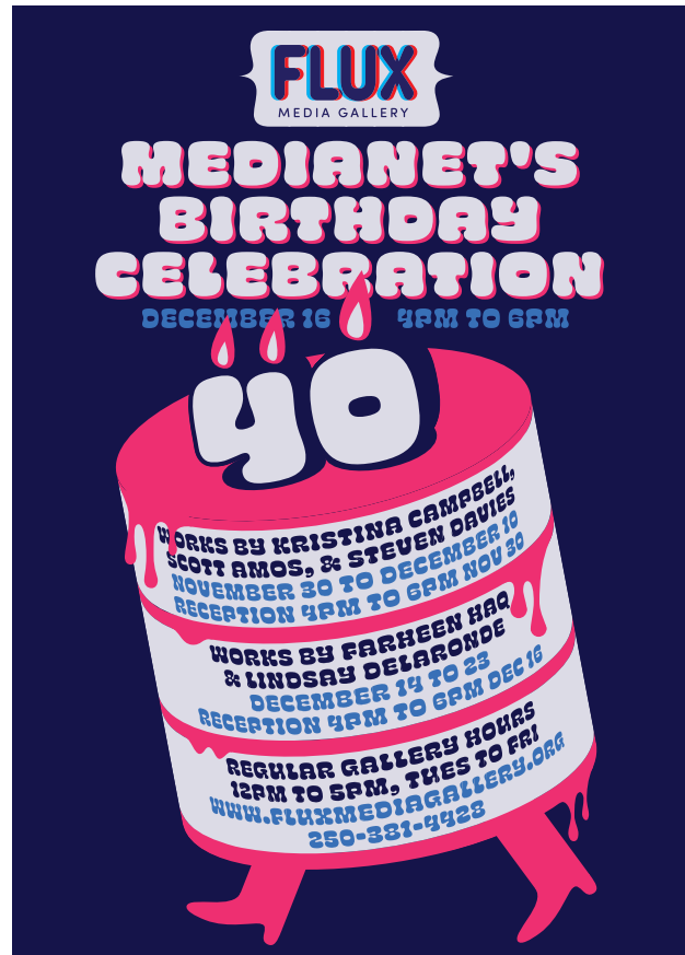
Poster by Leechtown Design